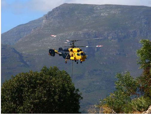
Kamov KA-32 – 5 ton lift