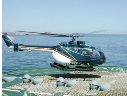
BO 105 (4 Pax) – Twin engine