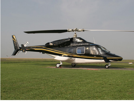
R23 700 / H + Vat