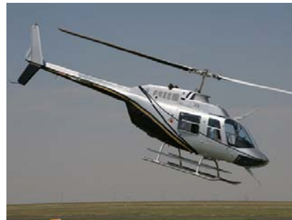
R6850 / H + Vat