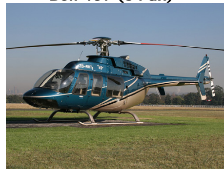
R11 500 / H + Vat