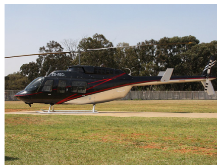
Bell Longranger 206L (6 Pax)