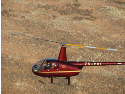
Robinson R44 (3 Pax)