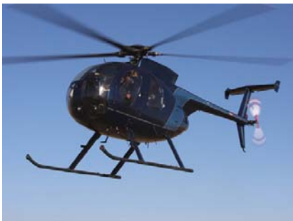
R6850 / H + Vat