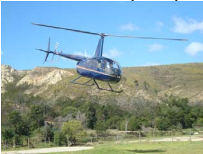
R4800 / H + Vat