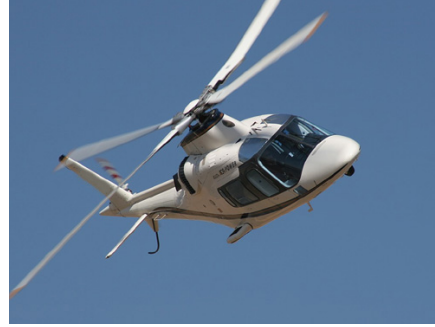
R23 500 / H + Vat