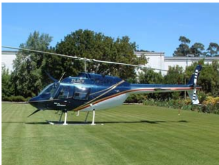
Bell Jetranger 206B (4 Pax)