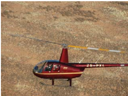
R4700 / H + Vat