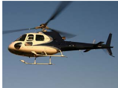
R14200 / H + Vat