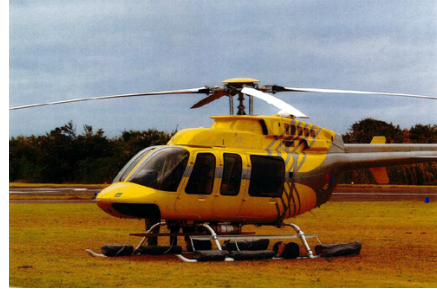
R11 200 / H + Vat