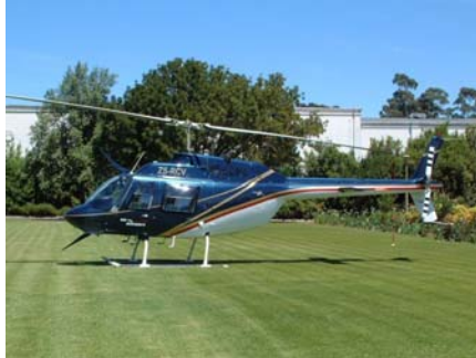
Bell Jetranger 206B (4 Pax)