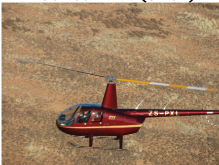
R4400 / H + Vat