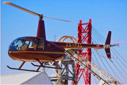
R4700 / H + Vat