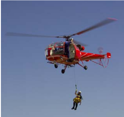
R14200 / H + Vat