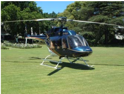
Bell 407 (6 Pax)