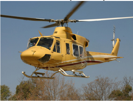
R27300 / H + Vat