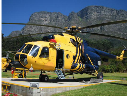
MI-8 P(4 ton lift) & MTV(5 ton lift)